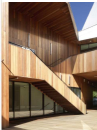
Héroult Arnod Architectes, Modern Music Centre, Évreux, 2017

From the outside, the volume is opaque, composed of triangular facets, some of them made of polished stainless steel that reflects the surrounding trees. It is imbued with a dual internal motion, the movement of the deck that crosses the building and the movement of the roof which rises gradually to embrace the main auditorium. The deck operates like an immense interior/exterior hall stretching from the street to the esplanade. This corridor distributes and shows the different architectural elements: the main auditorium hall, the local radio station studio, the recording studios and the club with live-music café and its glass double facade fan folded for acoustic reasons. The deck opens southwards to become a wide porch, an urban theatre that acts both as a terrace for the club, and as a stage for outdoor concerts or shows.