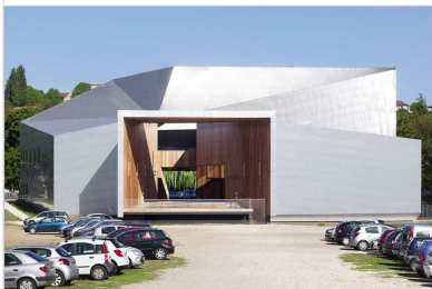
Hérault Arnod Architectes, Modern Music Centre, Éreux, 2017

This Contemporary Music Centre (SMAC) is a musical complex consisting of two different auditoriums and recording studios, linked together by a public area called "the deck", running through the building from end to end. The design is based on the principle that, instead of being mere consumers of entertainment, users can build their own experience by moving from one place to the other.