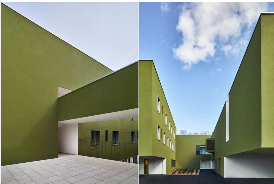
Dominique Coulon & associés, Home for dependent elderly people, Orbec, 2015

Architects have avoided using the conventional colours of the hospital environment, the colour red used in the interiors deconstructs the space and adds dynamic. The building has been designed to enhance the living and walking areas. Its strength lies in its relationship with the landscape.