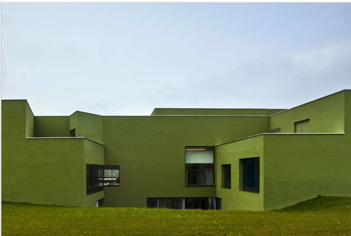
Dominique Coulon & associés, Home for dependent elderly people, Orbec, 2015

Architects have avoided using the conventional colours of the hospital environment, the colour red used in the interiors deconstructs the space and adds dynamic. The building has been designed to enhance the living and walking areas. Its strength lies in its relationship with the landscape.