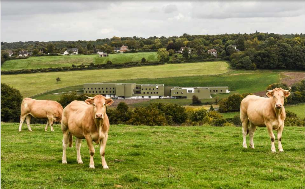
Dominique Coulon & associés, Home for dependent elderly people, Orbec, 2015

Architects achieved the desired effect by using the colour green, with the result that the building both blends into the larger landscape and reflects the rural nature of the site. The under-faces of the overhangs and the white walls of the base produce a feeling of lightness.