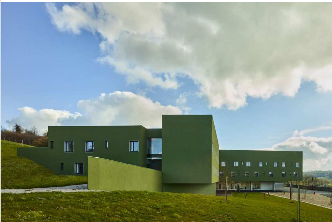
Dominique Coulon & associés, Home for dependent elderly people, Orbec, 2015

Architects achieved the desired effect by using the colour green, with the result that the building both blends into the larger landscape and reflects the rural nature of the site. The under-faces of the overhangs and the white walls of the base produce a feeling of lightness.