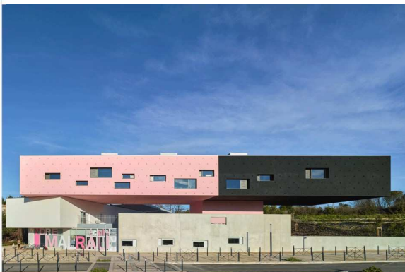
Dominique Coulon & Associés, André Malraux group of schools in Montpellier, 2015

The school unit designed by Dominique Coulon & Associés is part of Montpellier's program for development, in order to connect the city to the sea. The school is set on a small triangular plot of land, within the urban policy for building up a new residential area.