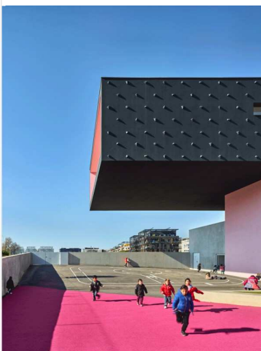
Dominique Coulon & Associés, André Malraux group of schools in Montpellier, 2015

The ground floor is taken up by the nursery school and the centre for pre and after school activities. The primary school occupies the second two floors, with a playground on top of the nursery school. The volumes are designed as autonomous elements which appear to slide over each other, with a cantilevering that provides a covered space for the playground. Each volume is colored in a different way and the bays have been designed according to their orientation and the level of light required.