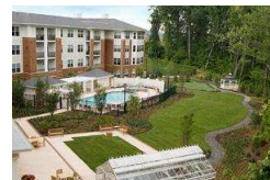
Evergreens at Columbia Columbia Hord Coplan Macht