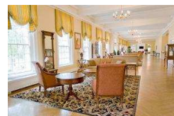
Springwell Baltimore, MD Hord Coplan Macht