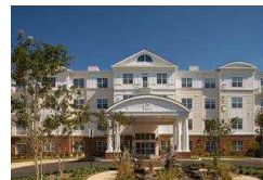
The Marque at Heritage Hunt Gainesville, VA Hord Coplan Macht

In drawing up this project, particular care has been paid to use and functionality. Everything has been done to use routes, natural light and materials to best advantage, producing living spaces which respect the dignity of their residents.