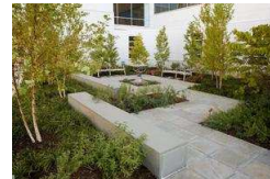
Sinai Hospital of Baltimore, Hess Garden Baltimore, MD Hord Coplan Macht