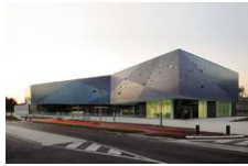
Inter-Generation Center >