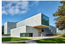
Henri Dutilleul Conservatoire of Music, Dance and Dramatic Arts, Belfort >