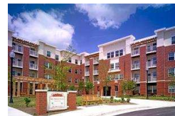
Shiloh Village Baltimore, MD Hord Coplan Macht